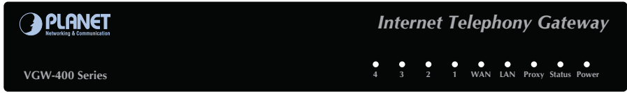
Front Panel of the VGW-400 Series