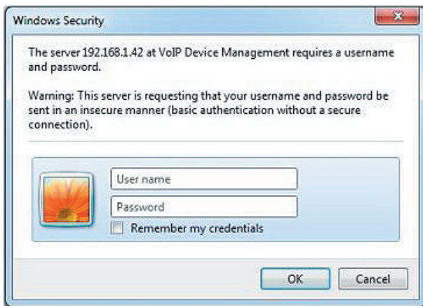
Login page of the VGW-400 Series