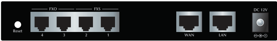
Rear Panel of the VGW-402